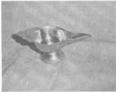
Figure 2 : Indigenous baby feeding cup.

A cleft child is more prone to episodes of diarrhea and the mother must be advised to consult a pediatrician in such an eventuality without much delay.